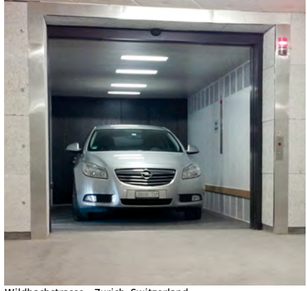
Wildbachstrasse - Zurich, Switzerland