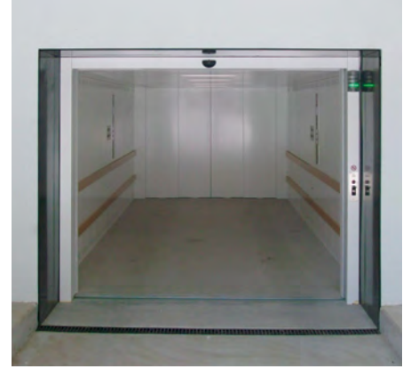
Bollerweg - Wädenswil, Switzerland