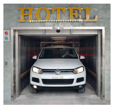
Garage Swissotel - Zurich, Switzerland