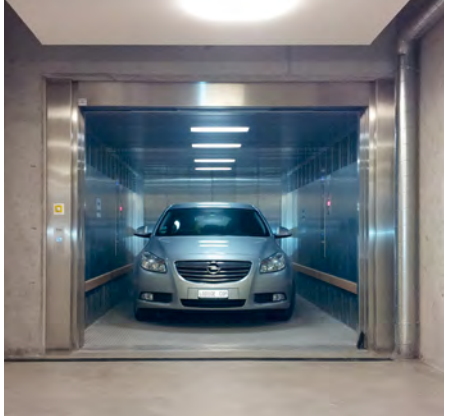
Underground car park - Zurich, Switzerland