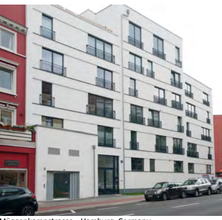
Müggenkampstrasse - Hamburg, Germany