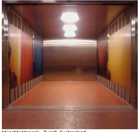
\label{eq:munich} \mbox{\sc M\"{\sc u}} \mbox{\sc nchhaldeneck - Zurich, Switzerland}