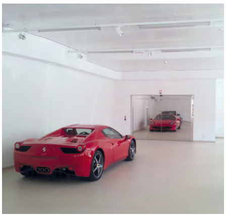
Garage Zenith SA - Sion, Switzerland